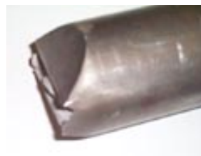
Normal "Pinch" Cut